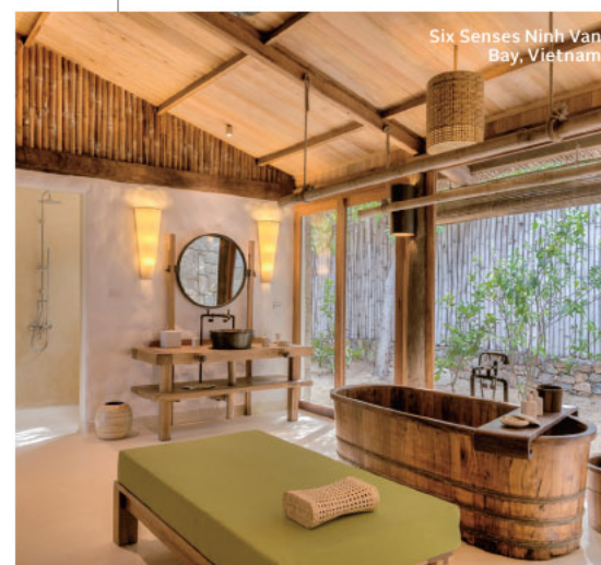
Six Senses Ninh Van Bay, Vietnam

Cast a Line → On an excursion available at Vietnam's Six Senses Ninh Van Bay , you'll spend the day angling with local fishermen before taking your haul to a cooking class. That night, enjoy your masterpiece in the ultimate romantic setting: The Wine Cave, a hillside rock cavern (from $660, sixsenses.com ).