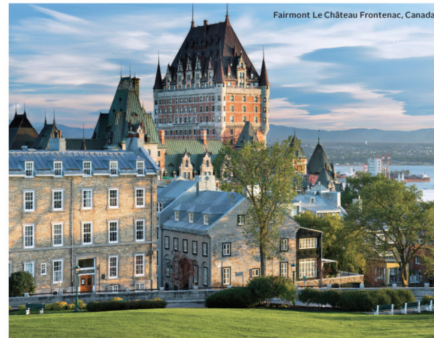
Fairmont Le Château Frontenac, Canada

+ For more amazing honeymoon ideas, go to marthastewartweddings.com/msw-travel