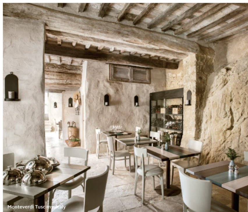
Monteverdi Tuscany, Italy

Kayak Into the Wild → Just over an hour by van and speedboat from Thailand's Krabi International Airport lies laid-back Koh Lanta, part of a 52-island archipelago protected by the Mu Koh Lanta National Park. Here, you can paddle through limestone caves, go hiking, and sunbathe on Ba Kantiang Beach (which is backed by a tropical forest). As for where to stay: Pimalai Resort & Spa is one of the area's few high-end resorts (from $187, www.pimalai.com ).