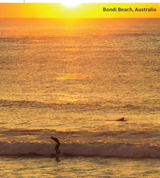
Bondi Beach, Australia

Surf Secret Spots → Ride the waves other surfers only dream about. At famous Bondi Beach and Byron Bay, the Let's Go Surfing school offers a private guide who will take you to the area's hidden breaks and tailor the trips to your skill level (from $210, letsgosurfing.com.au).