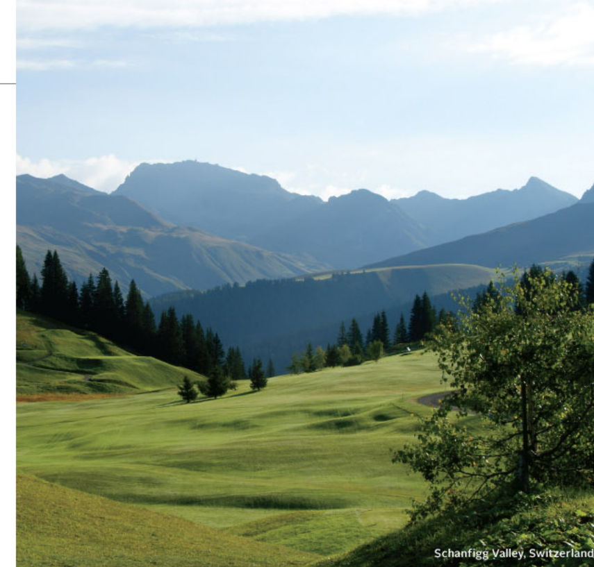
Schanfigg Valley, Switzerland

Plan a (Beach) Shack Attack → Forget fancy restaurants. In Negril, Jamaica, the more casual setting, the better. Hit Murphy's West End (876-367-0475) for its spicy jerk chicken and Sweet Spot (no phone) to try the national dish of ackee (a lychee relative) and saltfish.