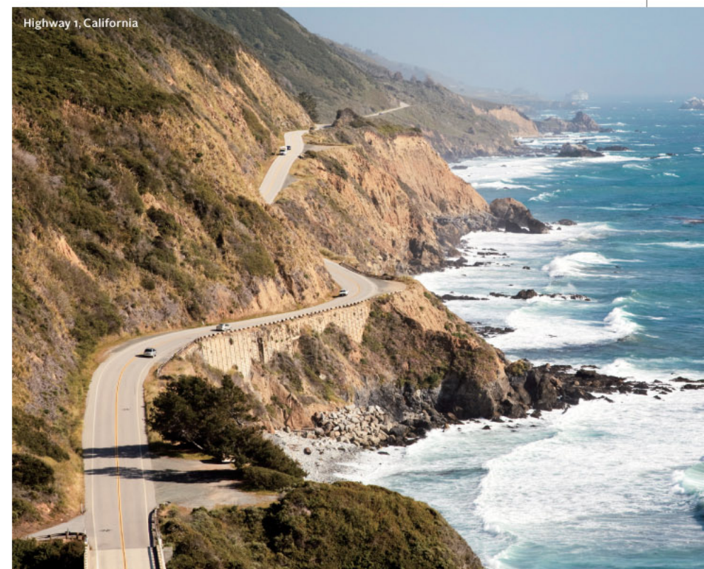
Highway 1, California

Take Your Show on the Road → Cruise north along Highway 1 from Los Angeles (don't miss The Broad , a new museum downtown; thebroad.org) to San Francisco. Along the way, stop to hike and take in the stunning cliffs-meet-ocean views of the haute-hippie town of Big Sur and the world-renowned Monterey Bay Aquarium (montereybayaquarium.org) before landing at San Francisco's Golden Gate Bridge.