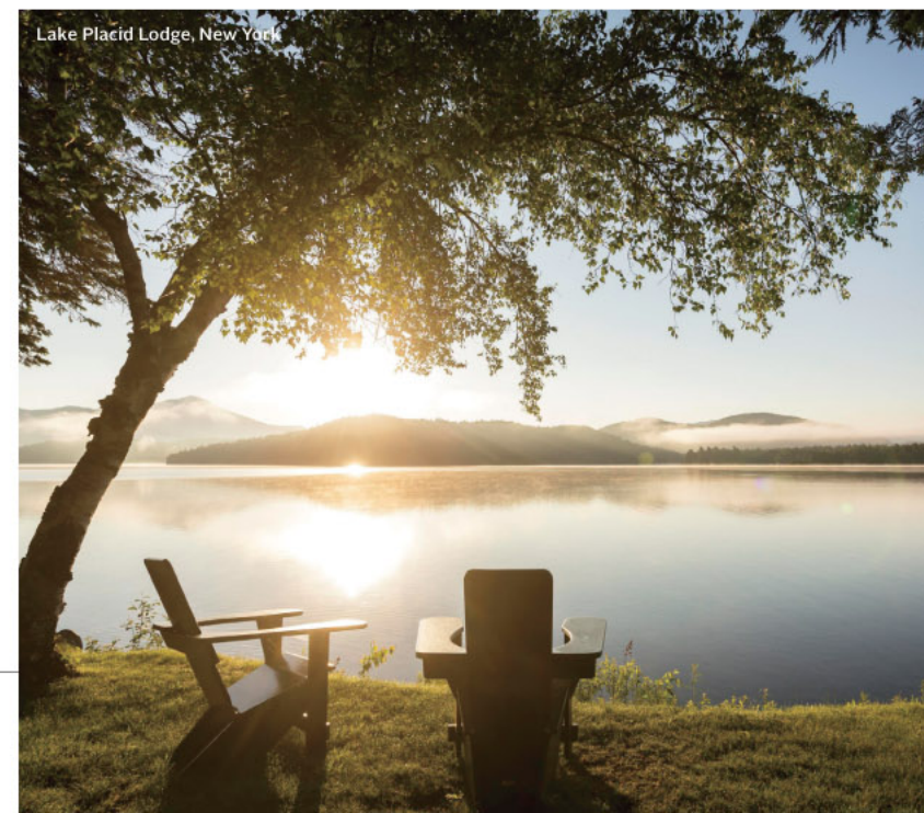
Lake Placid Lodge, New York