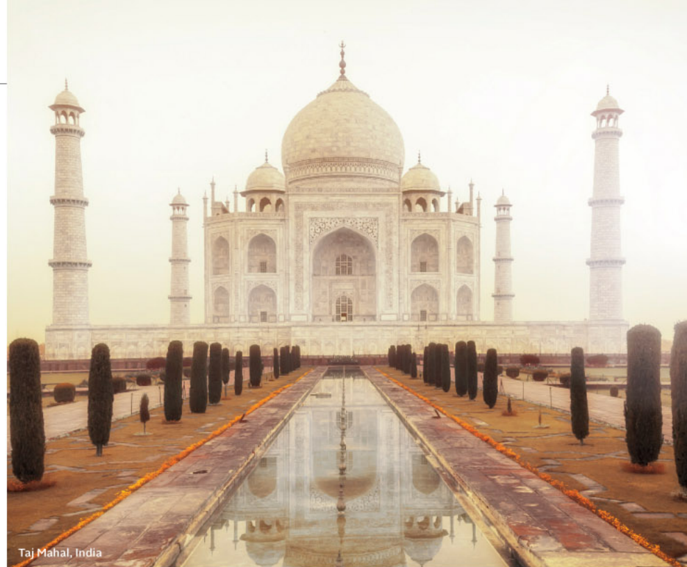
Taj Mahal, India