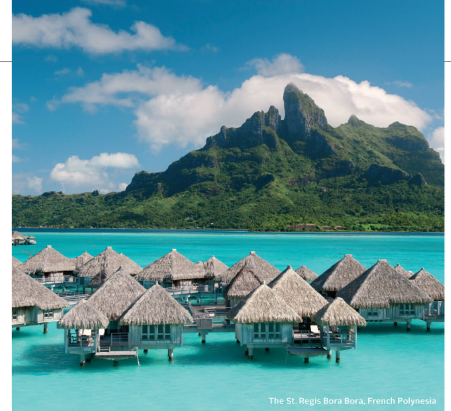
The St. Regis Bora Bora, French Polynesia

Float in Place → There are overwater bungalows—and then there are those at The St. Regis Bora Bora , in French Polynesia. The spacious one-bedroom villas are set right in a bright turquoise lagoon, and some come with whirlpools. Even indoors, the water is never far from sight, with walls of windows and glass panels in the floor (from $1,248, stregis.com).